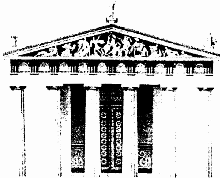
Facade of the Temple of Aesculapius, after Henri Lechat, c. 1895